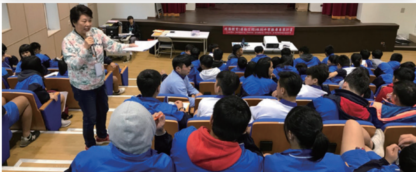
Sports Administration's Gender Equality Film Lecture Tour - The lecturer and students sharing their thoughts after watching the film at the New Taipei Municipal Zhuwei High School session