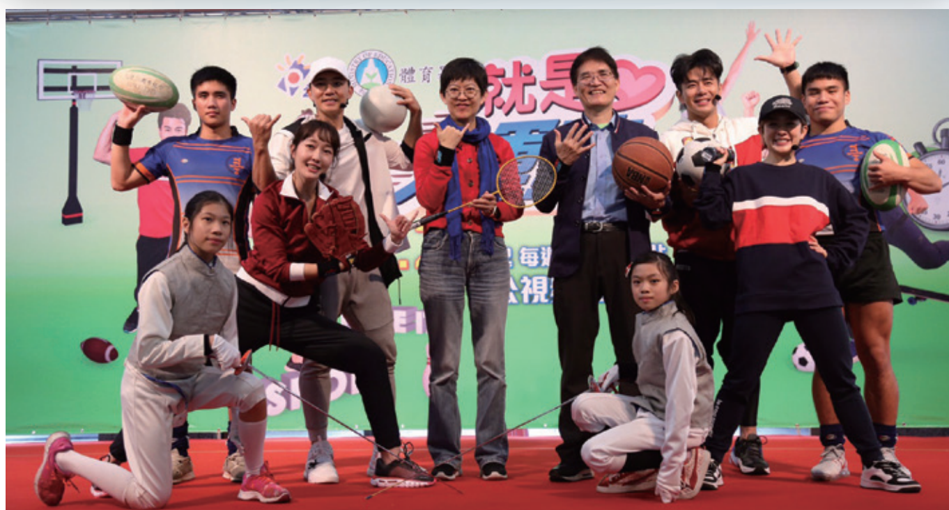
"Sport - I Like It" Season 6 broadcast date announced at the press conference

The Sports Administration's "Sport - I Like It" program has started its 6 th season and, for the first time, the program will include high school sports teams and introductions of team sports such as football and rugby. The students' interests in sports are able to be aroused by the enthusiastic and lively presentation of well-known hosts.